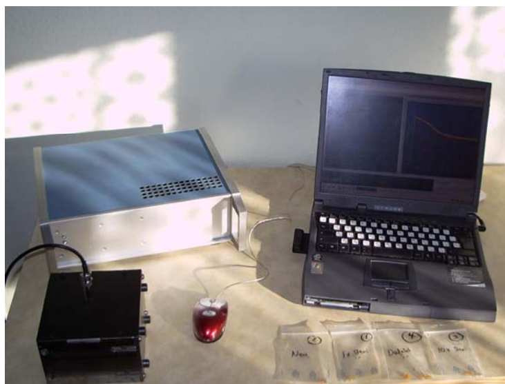
5-mm tube sensor with ^1\text{H} NMR frequency of 15.75 MHz (See photo below)

Spin Track TD-NMR spectrometer – Portable realization;